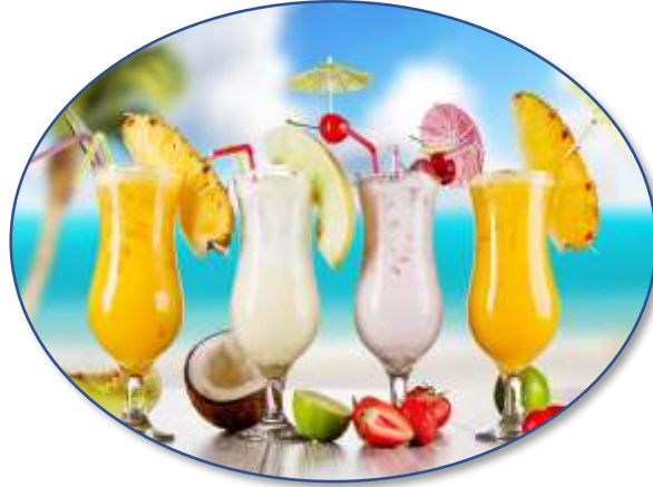
SMOOTHIE AND JUICE