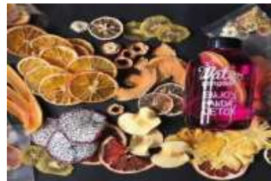
Detox dried fruits